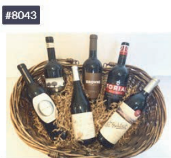
Go To The Head Of The Class- Reds