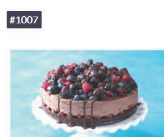
Dessert of the Month